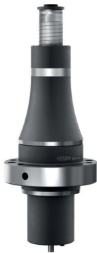
REISHAUER-Clamping Device DH30