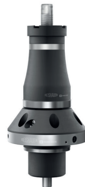
REISHAUER-Clamping Device DH19