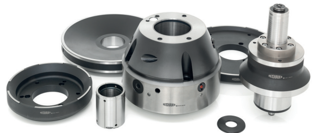
Clamping Device with base unit and accessories