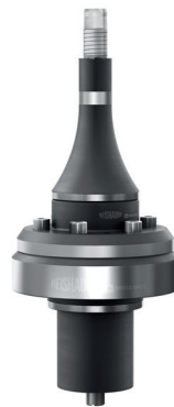
REISHAUER-Clamping Device DH16.707