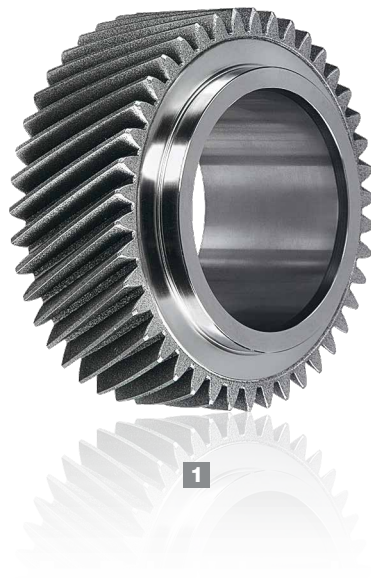
1 Diamond dressing gear